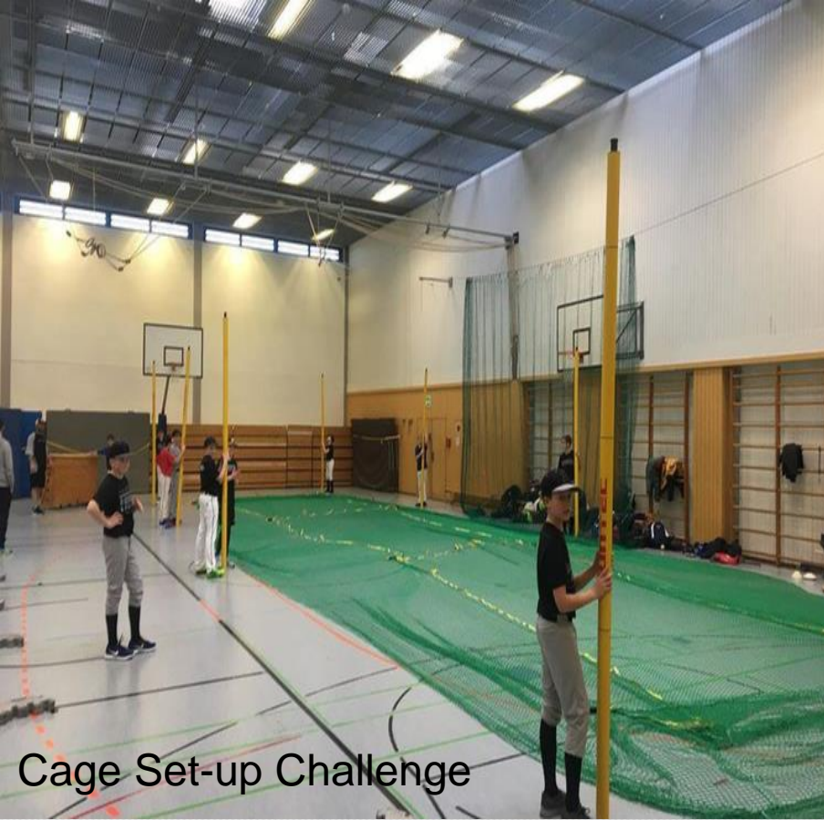
Cage Set-up Challenge