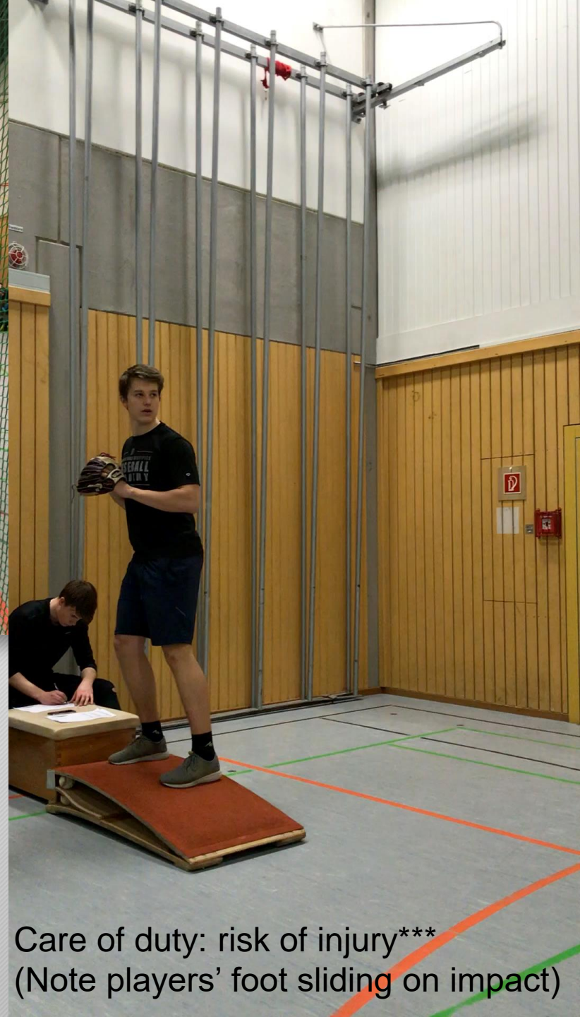
Care of duty: risk of injury*** (Note players' foot sliding on impact)

“The gymnasium hall was a basic solution to incorporate beginner baseball training 30 years ago, when the club was first established.”